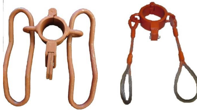
STANDARD SEMCO PIPE ELEVATORS HEAVY DUTY