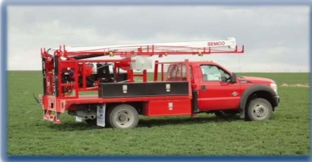
SEMCO S6,000 PUMP HOIST