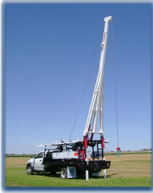
SEMCO S8,000 PUMP HOIST