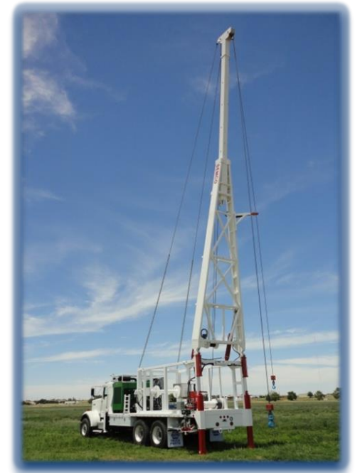
SEMCO S30,000 PUMP HOIST