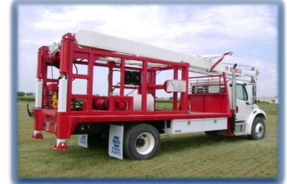
SEMCO S25,000 PUMP HOIST