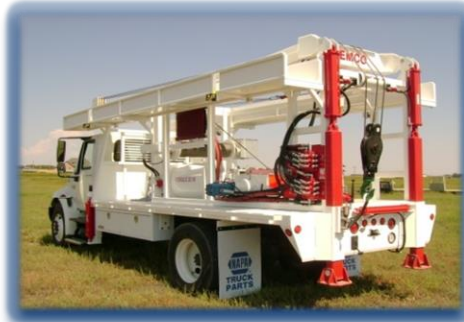
SEMCO S10,000 PUMP HOIST