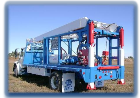
SEMCO S20,000 PUMP HOIST