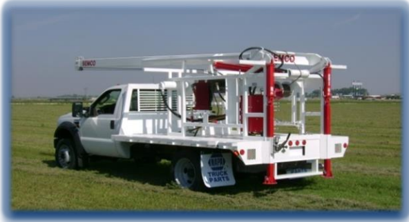
SEMCO S4,000 PUMP HOIST