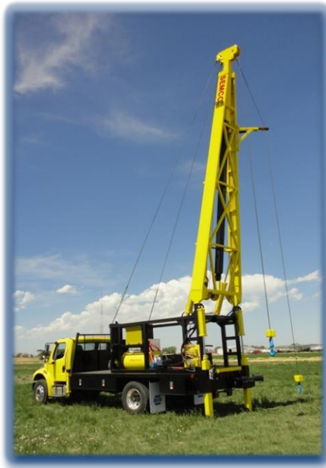
SEMCO S15,000 PUMP HOIST