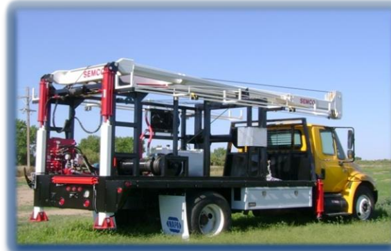
SEMCO S12,000 PUMP HOIST